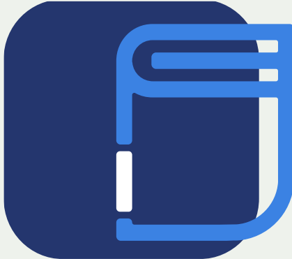
Learning @ Internet Society